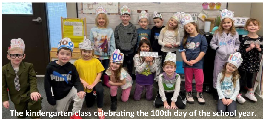
The kindergarten class celebrating the 100th day of the school year.